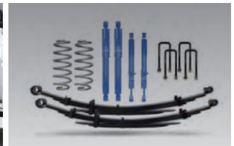
Suspension Upgrade 3.5T