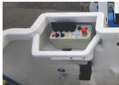
Emergency Start/Stop and control at basket