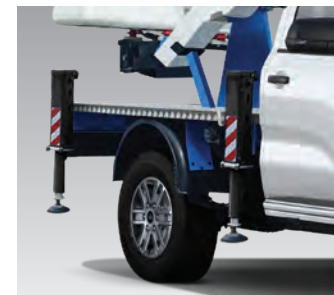
Front and rear outriggers Chassis leveling capability