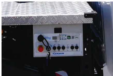
Emergency Start/Stop and control at rear tray