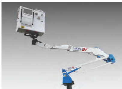
Telescopic boom with extension and swivelling realised.