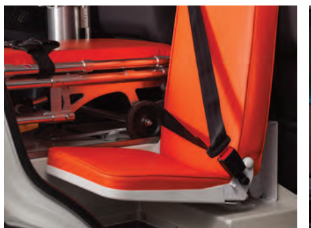
Folding attendant seats