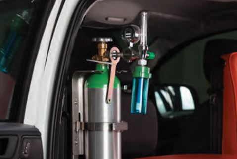
Oxygen cylinder (ME size) with holder