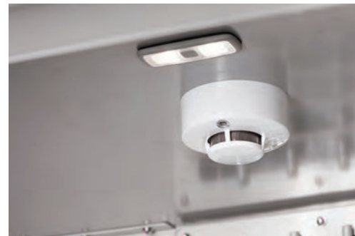
Dome light and smoke detector