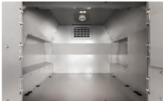
Cash box interior