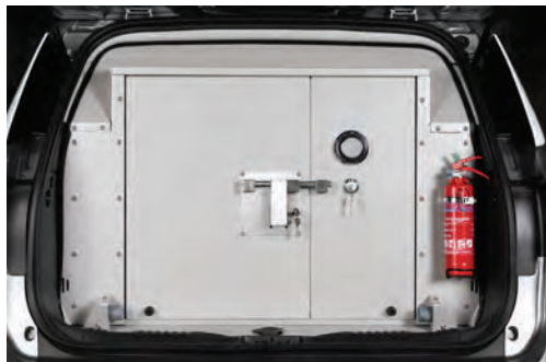
Cash box with double locking system