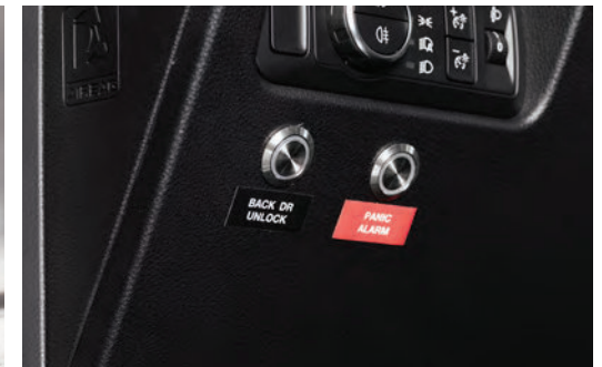
Panic alarm & Rear door locking switch