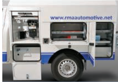
Multiple storage lockers