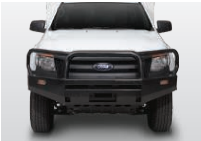
Front protection bull bar