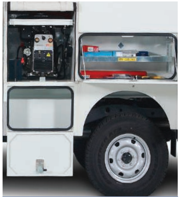
Multiple storage lockers with easy access to equipment