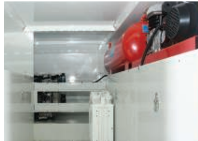
Interior storage for large equipment