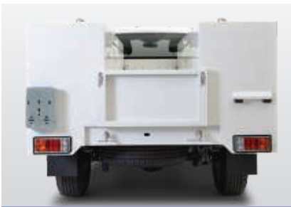
Maintenance roadster body