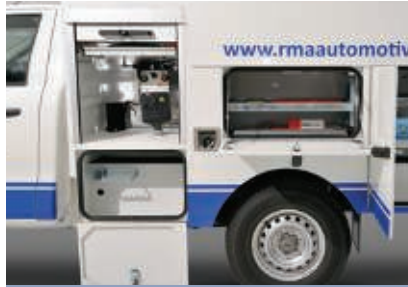
Multiple storage lockers