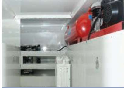
Interior storage for large equipment