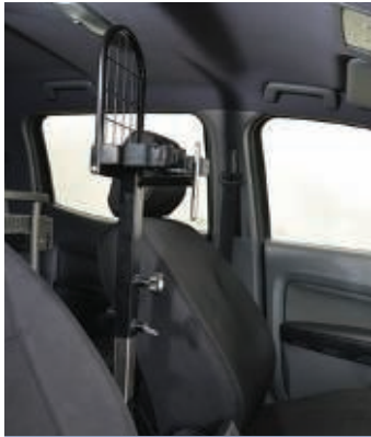
In car rack