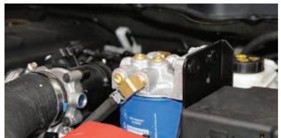
Enhanced fuel filtration system