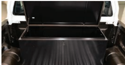
Accessory tool box