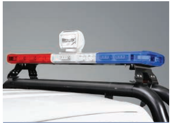
LED light bar