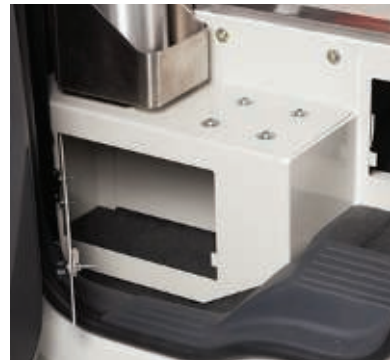
Under floor tools boxes