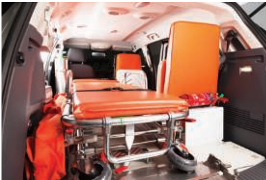
Single stretcher with double attendant seats, storage cabinet