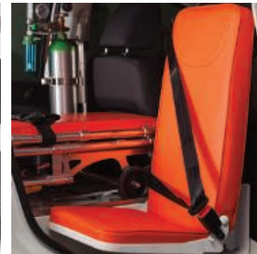
Folding attendant seats