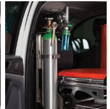
Oxygen cylinder (MD size) with regulator