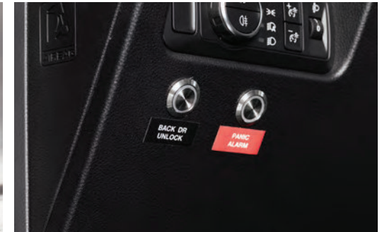
Panic alarm & Rear door locking switch